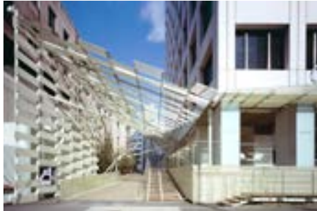
Office, Shop 2-7-15, Kitaaooyama, Minato-ku, 107-0061

The NTT Aoyama renovation project involves the conversion of the bottom floors. The reduction in the size of the equipment at telephone exchanges has made more space available, and the space that was previously occupied by “black boxes” is being opened up to the city. Finding effective ways of bringing the city into the building is a very relevant issue to contemporary society.