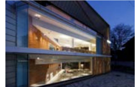
Showroom ( household electric appliance and apparatus for business use ) 4-23-8, Minamiaoyama, Minato-ku, 107-0062 0120 310 724 OPEN HOURS: 11:00-18:00 CLOSED ON WEDNESDAY

The space reflects the characteristics of Miele, such as accuracy, functionality, flexibility, and tenderness. To create the atmosphere of advanced functionality, and to make visitors feel comfortable, special attention is paid to the choice of materials: stainless steel, glass, and wood are harmoniously arranged in anticipation of the new living spaces of the 21st century and beyond.