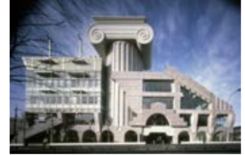
Ceremony hall 2-4-27, Kinuta, Setagaya-ku, 157-0073 +81 3 3749 0983

The M2 Building, located along Tokyo Ring Road 8 on the edge of Tokyo, was created as a design laboratory for an automobile manufacturer. The building is a chaotic mix of fragments made using various architectural styles, materials and scales. This collection of fragments was intentionally created in order to integrate these elements while accelerating and highlighting them. Of particular note are the hollow Ionian style column, antennae by the Russian architect Ivan Leonidov and sound insulation panels for the expressway which are polymerized in a threadless manner. It was later converted into a funeral home while retaining almost the entire original design.