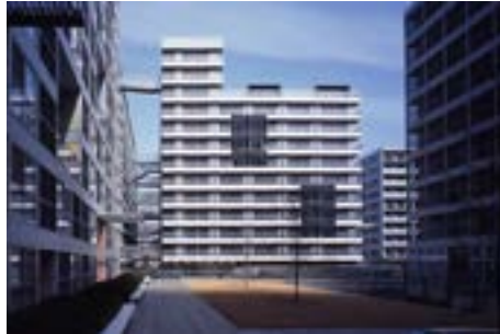
Apartment house, shop 1-9-17, Shinonome, Koto-ku, 135-0062 +81 3 5547 0180 (service center)

This project represents a new concept in public housing. It is located on reclaimed land in Tokyo, and combines dwellings, offices (SOHO – Small Offices, Home Offices), commercial facilities and public facilities. Multi-family housing in the 20th century has tended to only contain space for dwellings, eliminating other functions from the structure. This concept has been particularly dominant in Japanese public housing. The result has been a loss in the completeness of functions necessary for a high quality of life. This multi-family housing project mixes functions to the greatest extent possible, restoring a well-rounded quality and functionality to life here.