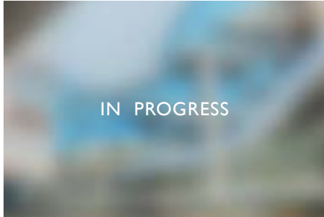
Station, Shopping center 2-24-1, Shibuya, Shibuya-ku, 150-0002