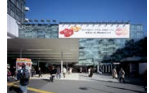
Station 1-1, Dogenzaka, Shibuya-ku, 150-0043 +81 3 3461 0587

Shibuya is the district in Tokyo most popular with the younger generation. Here, one finds junior and high school students with colored hair and strange outfits roaming around, squatting on the street and even sleeping at all times of the day and night. This is a town of chaos and boisterous energy: the streets are filled with images and signboards, and the classical segmentation of architecture and advertisements has lost its meaning. Boundaries separating architecture from visual images, materials from non-materials, and reality from virtual reality have all but disappeared. Everything is mutually dissolved in liquid form.