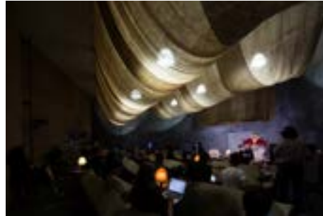
Music school 1-3-3, Shibuya, Shibuya-ku, 150-0002

Red Bull runs a “mobile” Music Academy that travels around the world. We designed the interior for their Tokyo version of the project. The idea is contrasting to that of a conventional school in a fixed location. We expressed the students’ liberal atmosphere by using old material, fabric (jute), pallet for forklift, which all feel friendly and street-wise. For spacing also, we removed the old static division of corridor and room, and brought in the idea of Roji (side street) and Engawa (semi outdoor veranda), more animated spaces, to realize a relaxed connection between rooms. Furniture was also down-to-earth, modeled on a feel from Zabuton (floor cushion) or tatami (straw mat). By translating sense of using them into the modern context, we did away with the strict image of old schools.