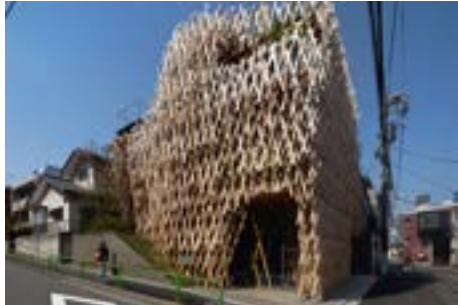
Pineapple cake shop 3-10-20, Minamiaoyama, Minato-ku, 107-0062 +81 3 3408 7778 OPEN HOURS: 11:00-19:00

We used a traditional joint system in wood structure construction in Japan called “Jigoku Gumi” to create soft warm human space that feels like a forest or cloud. The adoption of a 3D structure system enabled the cross section of one member to be reduced to as thin as 60mm x 60mm. This same type of wood members that are as thin as branches which were used to build this space are used to taste the pineapple cake made from carefully selected ingredients.