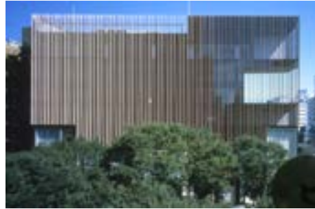
Office, Fashion building 3-5-29, Kitaaooyama, Minato-ku, 107-0061 OPEN HOURS: [shop] 11:00-20:00

The project is the head office building of a fashion group that stands at the entrance to Omotesando, often called the most beautiful avenue in Tokyo. Omotesando is a picturesque boulevard lined on both sides with huge zelkova trees that leads to Meiji Shrine, the largest Shinto shrine in Tokyo. My aim was to make these trees resonate and not conflict with the building. We created a mullion; 45 cm deep with laminated wood made of larch supporting the curtain wall. The stems would resonate with the lumber and the vertical lines of mullions would resonate with vertical lines of the trees. The wooden mullion also resonates with Meiji Shrine’s wooden architecture.