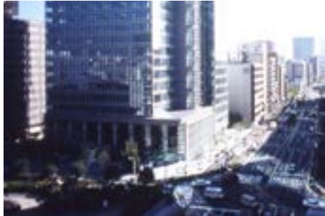
Office building 1-13-11, Tsukiji, Chuo-ku, 104-0045

The building is located in the neighborhood of Kabukiza, which accommodates restaurants, offices and residences. Stepping into the building, visitors are ushered into a long flight of stairs stretching to 30m. It was designed with the idea of tiered seating, which functions not only for ascending and descending, but also as an open space for the public.