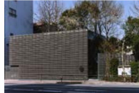
Japanese restaurant 5-1-5, Minamiazabu, Minato-ku, 106-0047 +81 3 5789 3838 OPEN HOURS: 17:00~23:00(L.O. 21: 00) CLOSED ON SUNDAY

This is one of the best Japanese restaurants in Tokyo, reflected by its Michelin ranking. The road and building are separated by screens that were made by slicing 100mm thick existing cement panels into pieces measuring 200mm to create serene space in the center of the city. This project consisted of a challenge to make the leap of creating luxurious space for a high-class Japanese restaurant by simply slicing an inexpensive industrial product. It also represents a criticism of the use of bamboo, Japanese paper and clay walls in Japanese restaurants which has become a cliché.