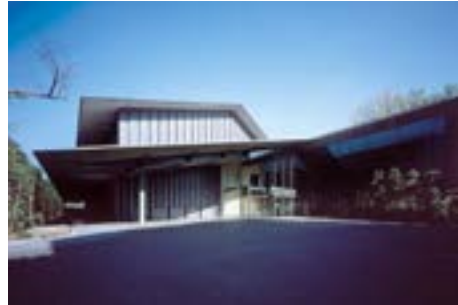
Museum 6-5-1, Minamiaoyama, Minato-ku, 107-0062 +81 3 3400 2536 OPEN HOURS: 10: 00-17: 00 CLOSED ON MONDAY

The design theme for this museum in the center of Tokyo consisted of adopting a unique roof design to blend the interior space with the garden. The interior display space was made integral with the garden by providing large glass openings in an attempt to merge the garden, building and artwork. Surrounded by a verdant garden and featuring a bamboo lined approach, the focus was to create spiritual art space that provides a respite from the hustle and bustle of the city.