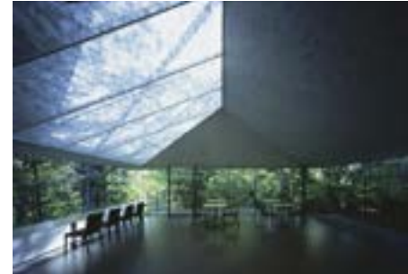
Cafe 6-5-1, Minamiaoyama, Minato-ku, 107-0062 +81 3 3400 2536 OPEN HOURS: 10: 00-17: 00(L.O. 16:15) CLOSED ON MONDAY

The café is located in the garden of Nezu Museum. Visitors can enjoy the view of the woods through the glazing and enjoy subtle light from the top as well, as if sitting among the trees. Tyvek is applied as the material for the wall and the ceiling.