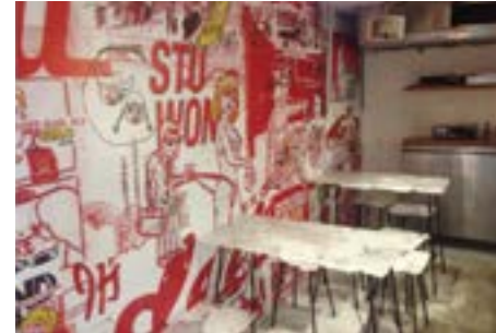
Yaki-tori-ya restaurant Hamonika-yokocho, 1-1-2, Kichijoji- honcho, Musashino-shi, 180-0004 +81 422 20 5950 OPEN HOURS: 15:00-23:00

The project took place in Kichijoji (one of Tokyo's suburban towns)'s Harmonica Yokochi, a wondrous bystreet that still retains the atmosphere of black-market stalls during the post-World War II period. We designed the interior for a small Yaki-tori bar that sits on the edge of the street.