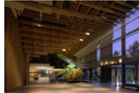
Hotel 2-10-3, Nagata-cho, Chiyoda-ku, 100-0014 +81 3 3503 0109

The hotel was built initially in 1963, one year before the year of Tokyo Olympics, and had attracted celebrities such as the Beatles, Michael Jackson, Luciano Pavarotti, and others. The old building was taken down in 2006, and the new building opened in 2010 as the Capitol Hotel Tokyu. The name “capitol” came from the parliament building located in the same area. Though it is situated in a high-rise tower, the lattice on the exterior and the stacked truss on the interior create a light feeling of traditional Japanese wooden architecture.